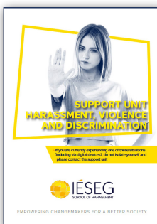
Support unit harassment, violence and discrimination guide