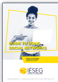
Guide to using social networks

Find all of the School's guides and media on the IESEG media center